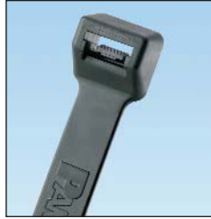
No Buckle Design